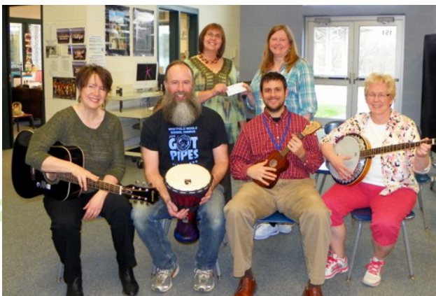
Music Department - Friends of Education Fund

You can personalize your giving with a Donor Advised Fund. With this type of fund, you recommend the specific charities that you want to support. Working with our experienced grantmaking staff, you target the issues that you care about the most, and the grants are distributed in your fund's name to the designated organizations. A donor advised fund is simple, powerful and highly personal.