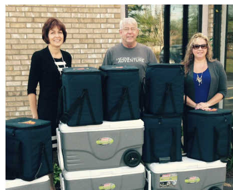
Meals On Wheels - Community Benefit Grant

Ripley Community & Heritage Fund Silver Creek-Irving Heritage Fund The Westfield Fund