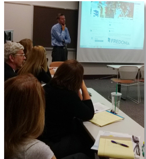
BICEP Training - Strategic Planning Workshop

How to Launch a Social Media Strategy A How-To Fundraising Webinar for Nonprofits Introduction to Proposal Writing Proposal Budgeting Basics Your Board and Fundraising What Your Nonprofit Needs to Know About .NGO and .ONG The Art and Science of Social Media Introduction to Project Budgets Blogging Best Practices for Nonprofits Creating Visual Content for Your Nonprofit Science of Social Networks: Tips and Tricks for Nonprofits