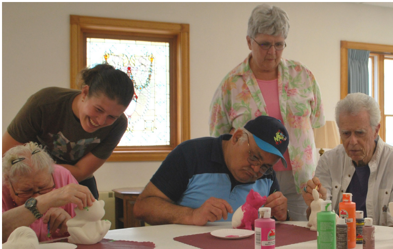
Chautauqua Adult Day Care Ceramics Program

Boys & Girls Club of NCC Fund Brooks Memorial Hospital Hortatio & Julia G. Brooks Trust Josephine P. Clark Fund Hequembourg Fund Alberta Wills Johnston Fund Adam Kessler Fund Elizabeth E. Macro Fund Lester R. Seibel Fund Chautauqua County Fair Endowment Fund Chautauqua County Historical Society Fund Chautauqua Leadership Network Fund Chautauqua Watershed Conservancy Fund Dunkirk Free Library Fund First United Presbyterian Church of Dunkirk Fund Hospice Chautauqua County Fund Jamestown Audubon Society Fund Lakeshore Humane Society Verona Barker Memorial Fund Literacy Volunteers of Chautauqua County Fund Suzanne McLain Campus & Community Center Fund Sinclairville Free Library Fund United Way of Northern Chautauqua County Fund Westfield Memorial Hospital Foundation Fund WNY Land Conservancy Fund