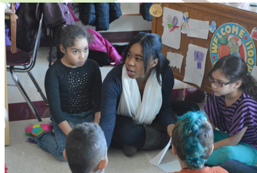
Dunkirk City Schools - Portraying Positive Images