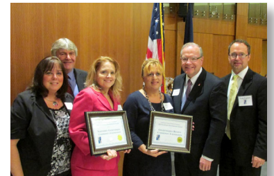
NCCF & CRCF receive Chautauqua County Chamber of Commerce's 2015 Economic Development Award