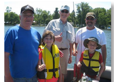
Environmental Grant - Fishing Essay Contest

*** All previous presidents served as board members.