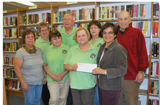
Ripley Community & Heritage Fund 2015 Grant Award

Chautauqua Children's Safety Education Village East Ripley Cemetery Association Quincy Rural Cemetery Association Ripley Free Library Ripley Hose Company #1 Ripley United Methodist Church Youth Group Ripley Veterans Roll of Honor South Ripley Hose Company Westfield Memorial Hospital Foundation