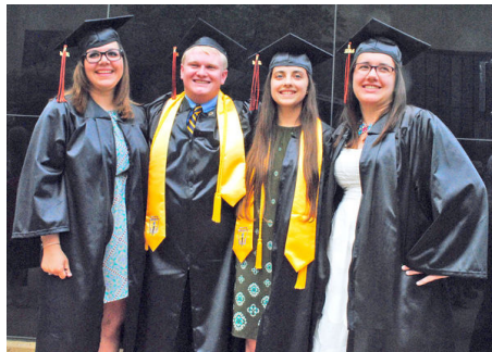
FCS Education Assistance Scholarship Winners