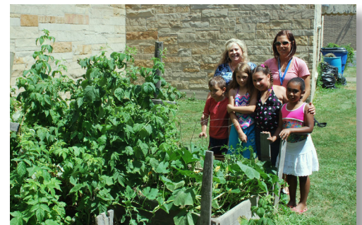
Boys & Girls Club of Northern Chautauqua County - Garden of Giving Program