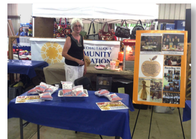
NCCF at the Chautauqua County Fair