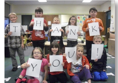
YWCA After School Program