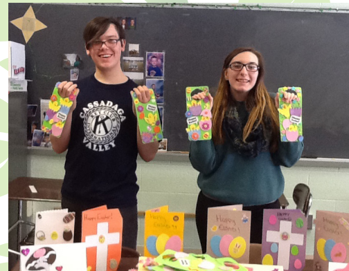
Cassadaga Valley Central School Key Club: "Caring to Connect"

Service Learning Grants fund projects that tie traditional learning to community service. All middle and high school teachers in our community are encouraged to apply. Want to know more? Contact us at 716-366-4892.